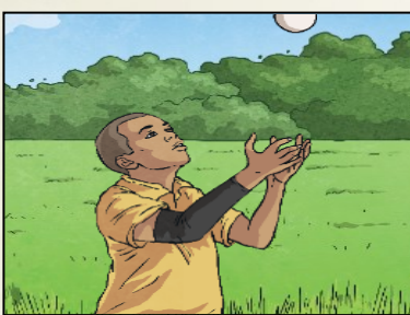
Catching a High Ball