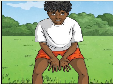
Catching a Straight Ball (low to mid pathway)

Through some activities and drills, these were the three types of catches that were practised.