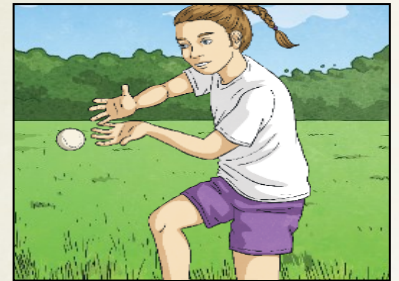
Catching a Straight Ball (side pathway)