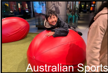
Australian Sports Museum